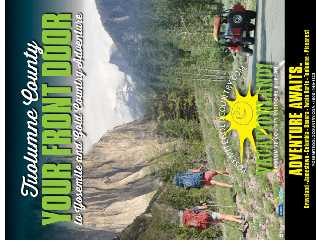
Magazine Trim Size: 8.375" x 10.875"